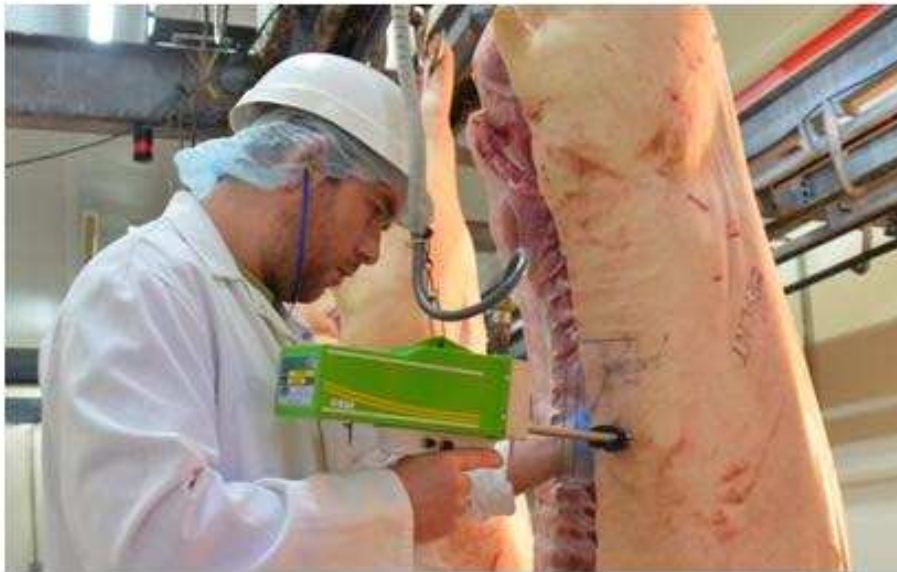
SITE DE MESURES